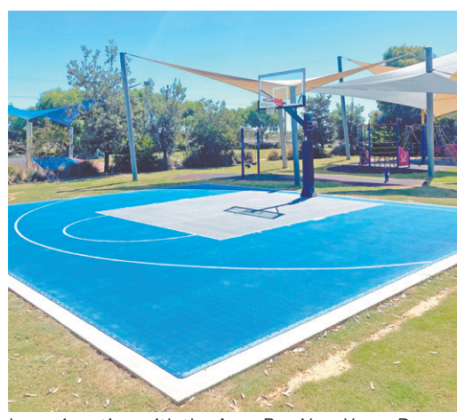
In conjunction with the Arno Bay New Years Day Committee and CWA Branch, the new Basketball Half Court is complete in Arno Bay at Turnbull Park.