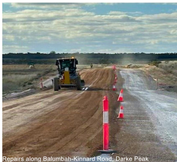
Repairs along Balumbah-Kinnard Road, Darke Peak