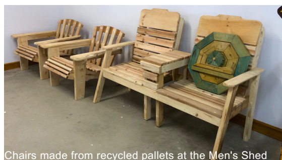
Chairs made from recycled pallets at the Men's Shed