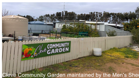
Cleve Community Garden maintained by the Men's Shed