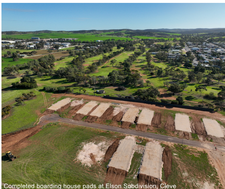
Completed boarding house pads at Elson Subdivision, Cleve

Stay connected with us. Subscribe to our Newsletter by visiting our website