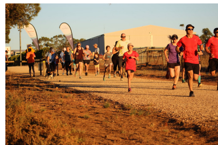
Yeldulknie Weir parkrun

There are also plenty of scenic attractions to visit: